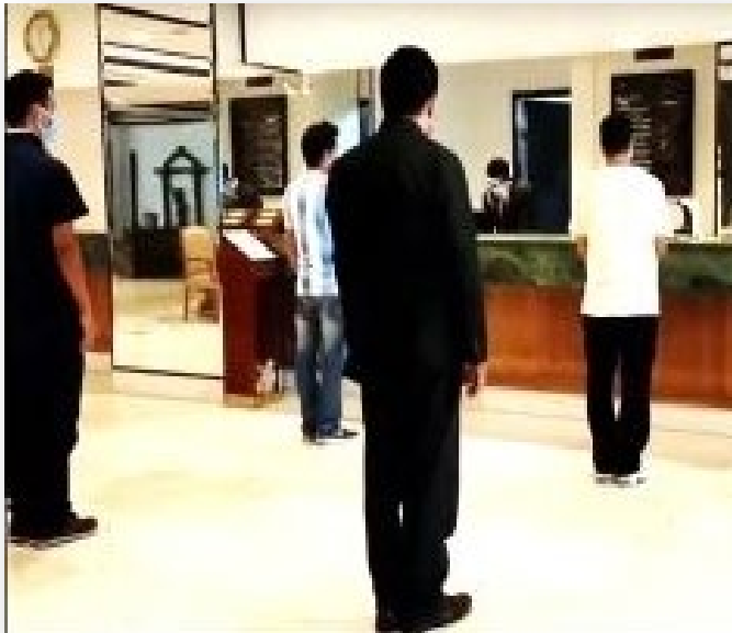
Floor markers & que managers for guests to be in queue respecting social distancing