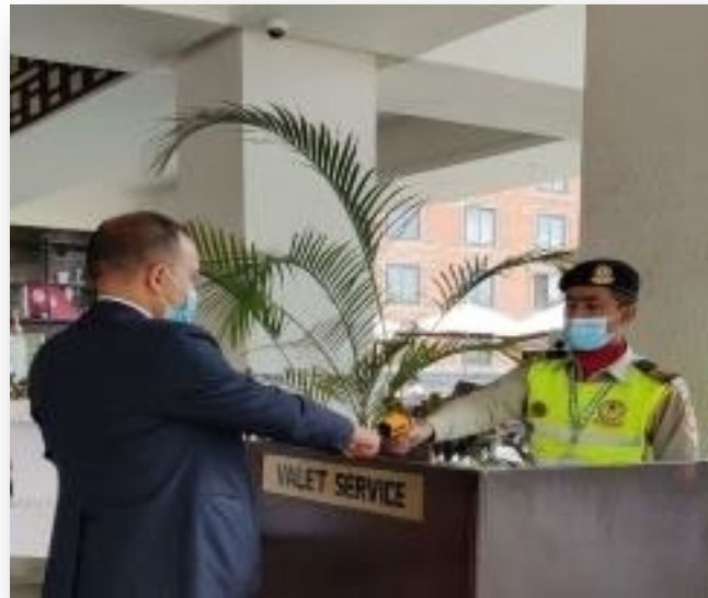
Mandatory temperature checks for all guests upon arrival.