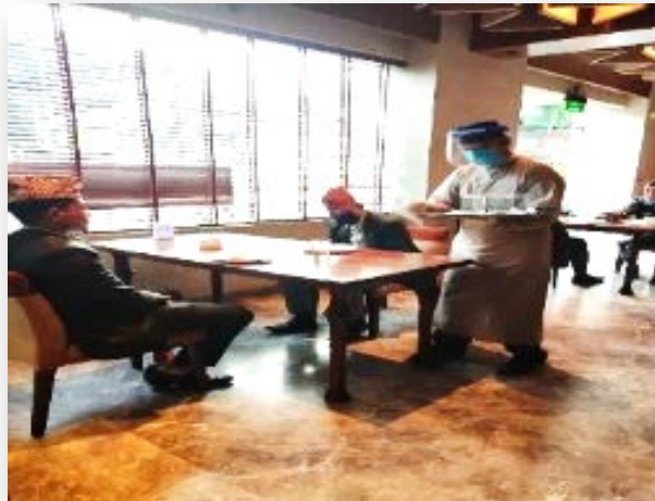
Colleagues servicing the guests wears mask, gloves, face protector and full sleeve gown to avoid cross contamination