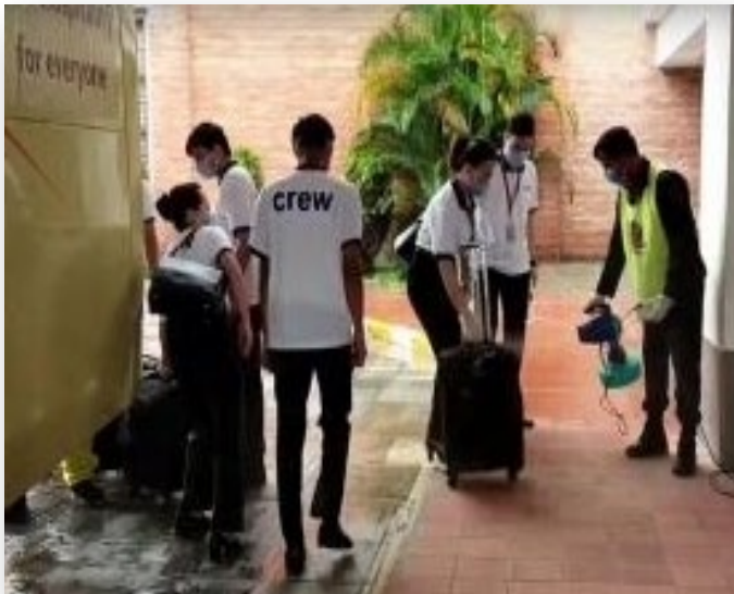
Baggage are sanitized with the fogging machine before entering in the lobby.