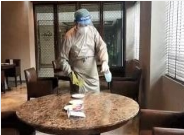
Disinfecting the table and chairs after every clearance.