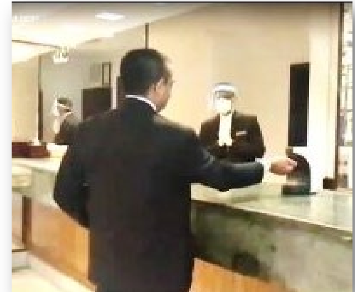
Auto hand sanitizers are available. Colleagues wear mask, gloves, and face protector at the front desk.