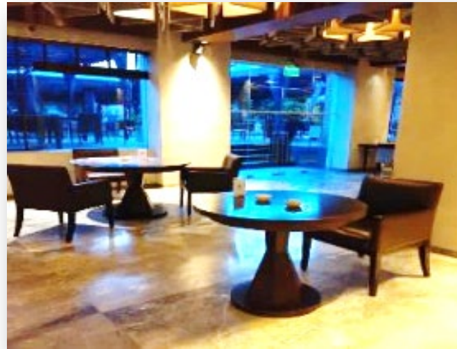
Social distance arrangement maintained between each table at the restaurant