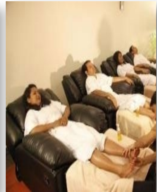
Safety protocols followed for recreational facilities such as GYM, Spa, Saloon etc.