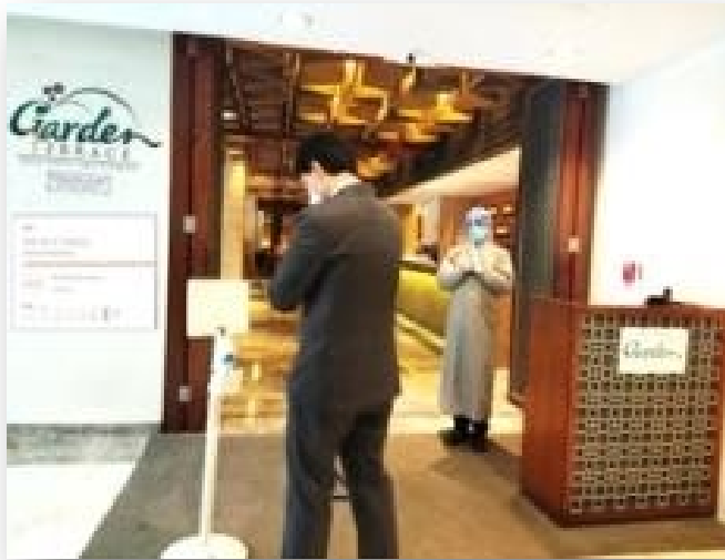
Automated sanitizer placed at entrance of the restaurant