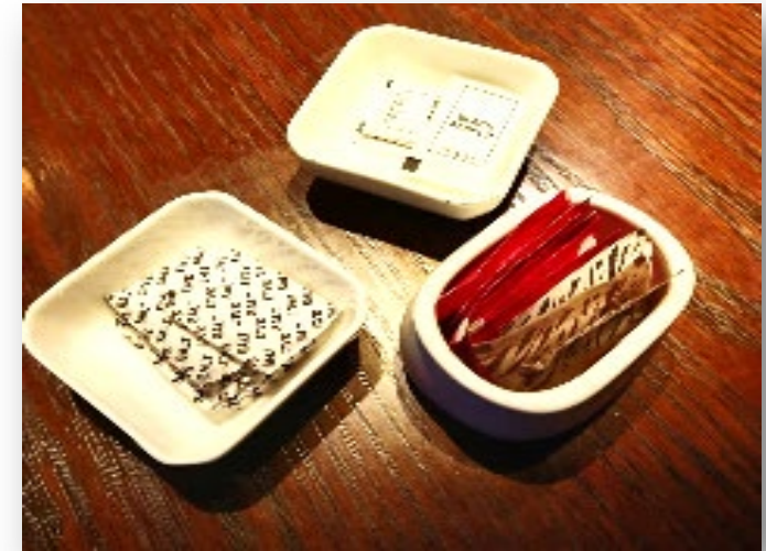
Individual condiment sachets are placed instead of containers