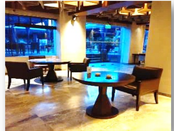
Social distanced seating arrangement with appropriate distance maintained between each table at the restaurant