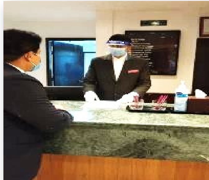
Guest details like valid ID & CC details collected before arrival to avoid contact.