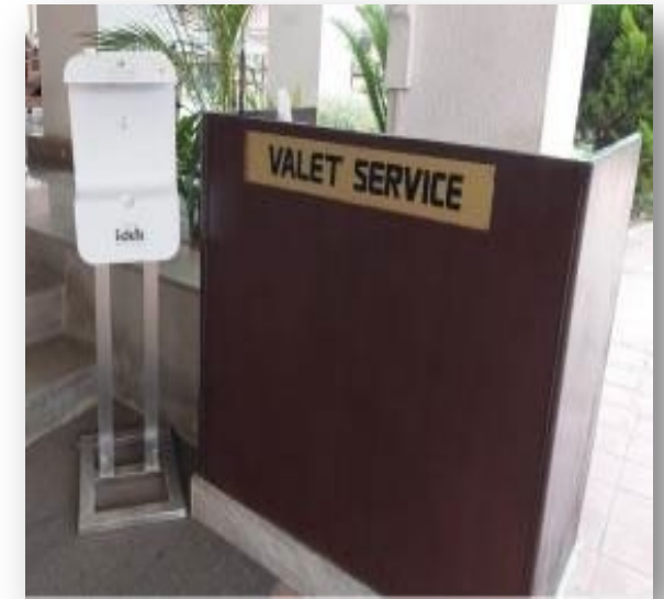
Mandatory hand sanitization before entry into the premises.